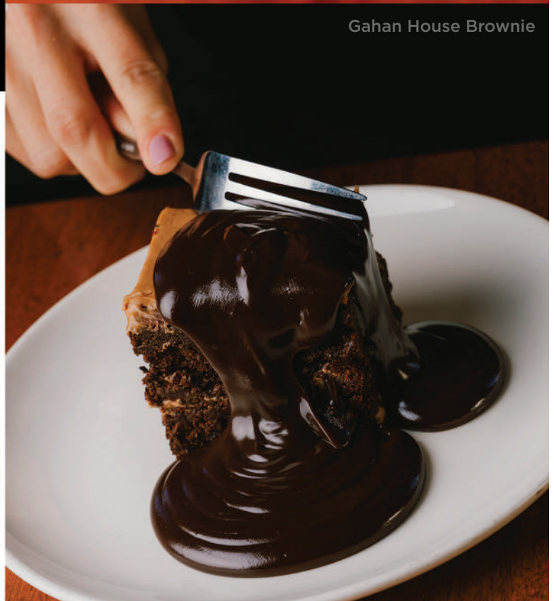
Gahan House Brownie

These items are available OR can be modified (*) to be VG* = Vegan, V* = Vegetarian, GF* = Gluten-Free, DF* = Dairy-Free